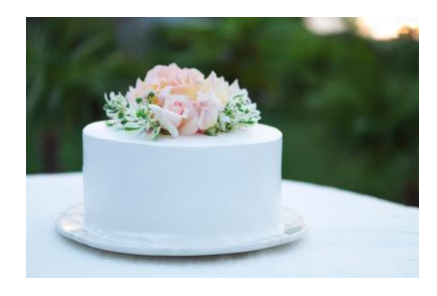
Live your life and forget your age!