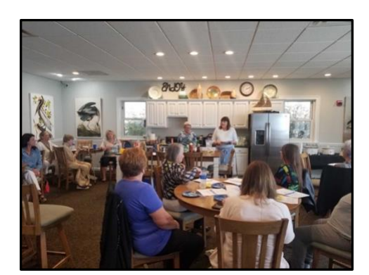
Members Eager to Learn